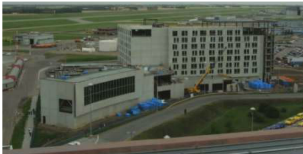
Figure 2: Construction progress in early June 2012

For Supreme Group, an opportunity to be involved in a third consecutive project for the ongoing expansions at the Edmonton International Airport was reason enough to propose innovative ideas with the owner and design team assembled for the planned 178,000 sq. ft. Courtyard Marriott Hotel. Those early meetings were focused on understanding the needs of the project and sharing knowledge of a newer method of steel-framed construction to satisfy the imposed requirements of minimizing cost and construction duration within a cold-climate environment.