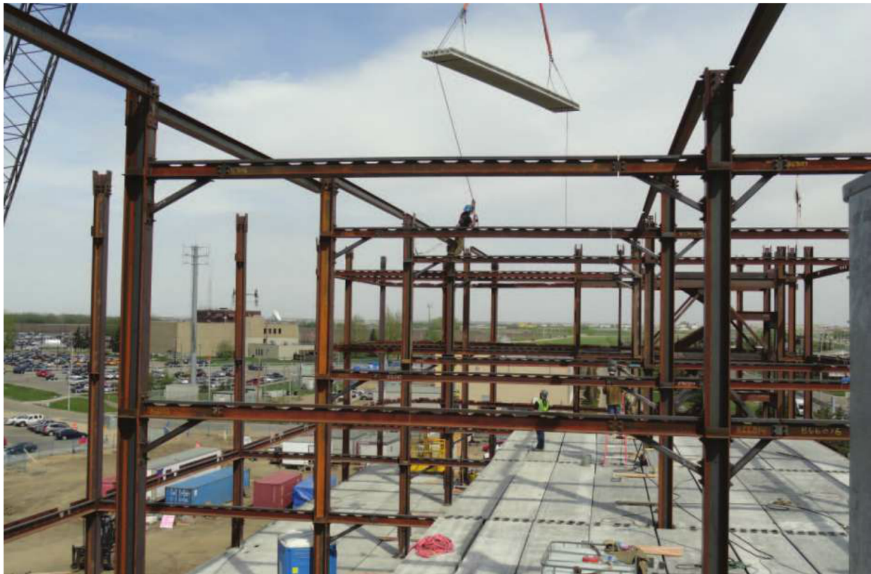
Figure 1: East wing of hotel under construction by ironworkers