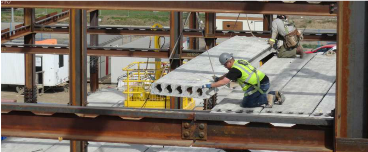
Figure 4: Hollow-core panel installation