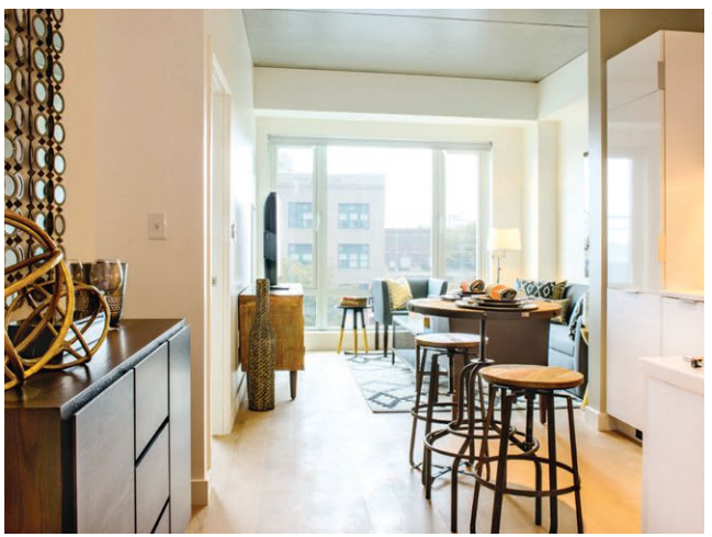
The apartments range in size from 380 sq. ft to 870 sq. ft.

Erection of the 20-story tower, showing the sequence of enclosure on the lower levels during construction of the upper levels.